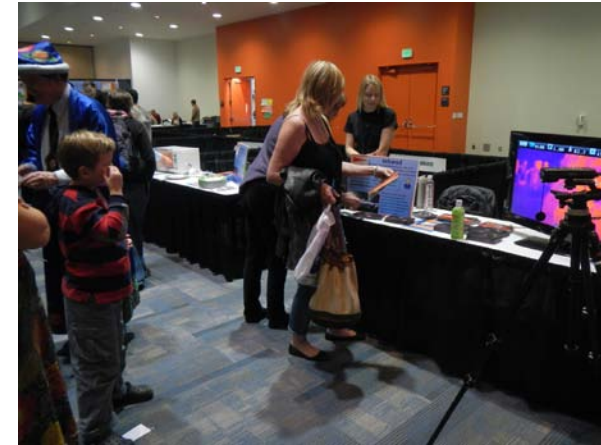
Photos: the infrared camera at the UC Berkeley infrared booth.

Exploration Station was a great opportunity to connect with other scientists and science educators and was a great place for getting new ideas for educative science activities. ...Everyone there was very enthusiastic about science and education, so it was a very inspiring event to be a part of! -Five Stars college grad mentor